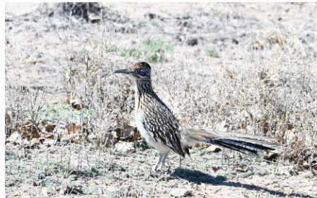
8 Greater Roadrunner