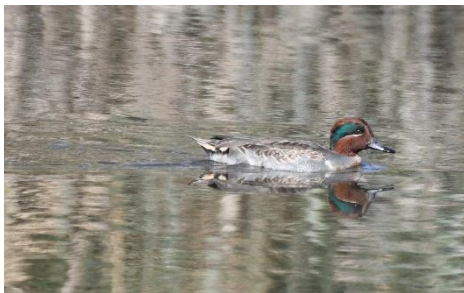
7 Green-winged Teal