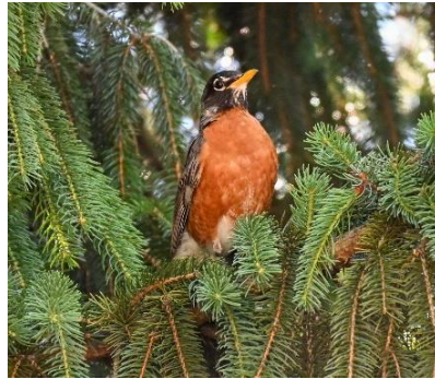
2 American Robin