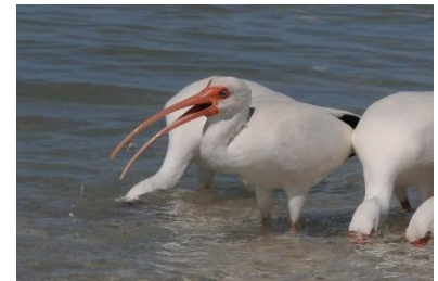
9 White Ibis