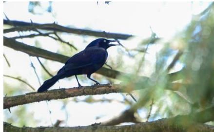
5 Common Grackle