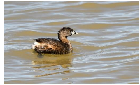
3 Pied-billed Grebe