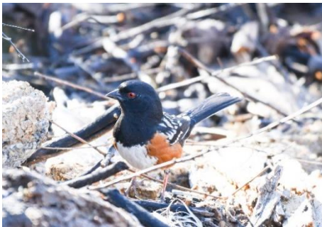
4 Spotted Towhee