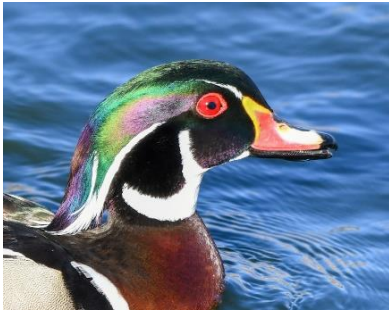
1 Wood Duck