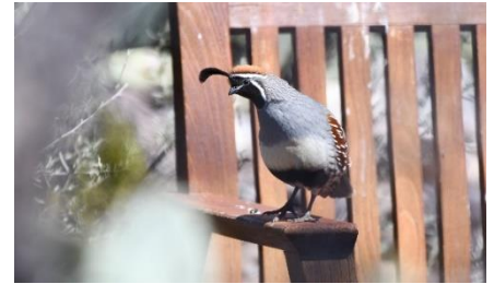
6 Gambel Quail