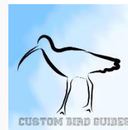
CUSTOM BIRD GUIDES